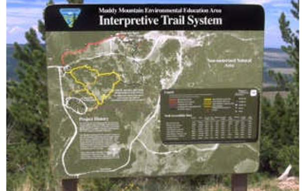
TUFF Cover is used to protect Wyoming's outdoor Park and Trail Signs.

TUFF COVER™ Is an Eight mil. velvet textured clear laminate that protects your underlying graphics from a host of harsh elements. It is easy to handle and laminate (even by hand) to most smooth printed surfaces. The easy-to-read matte surface prevents glare. Our latest development is new TUFF COVER UV MAX™. Its UV blocking power can extend the life of your graphics up to twice as long. TUFF COVER non-UV and UV MAX are both available in rolls up to 54" wide at $.98 to $1.16 per square ft.